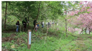
“Twin Leaf Forest” (Takaoka City, Toyama Prefecture)

Over the five years since 2013, we have planted 2,500 broad-leaved tree saplings, and since then we have been working on nurturing them by cutting vines that have become entangled with the saplings.