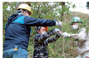
Cutting of vines