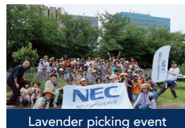
Lavender picking event