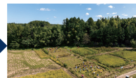
Paddy in Ravine, Before and After Reclamation