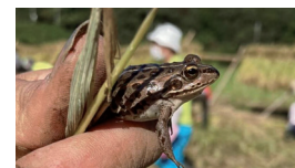
Returning of wildlife