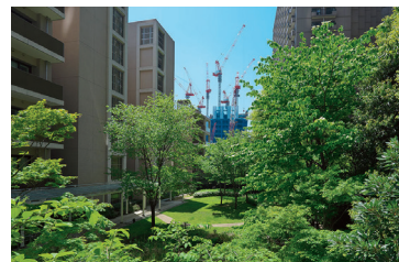
ARK Hills Sengokuyama Mori Tower

Primarily local, native species are planted in this project and dead trees to provide living things with homes and feeding sites are also placed. The topsoil was reused to create a green area for the preservation and restoration of biodiversity. As a result, this green area has acquired the highest (AAA) JHEP certification, a first in Japan. Following the completion of construction, we conduct maintenance and management with consideration of the ecosystem, and, by placing explanatory signboards and holding workshops, provide opportunities for local people to understand nature and interact with living things.