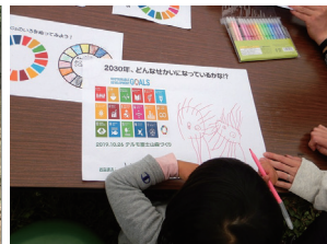
We painted our SDGs