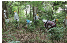
Working in a forest in Fujisawa