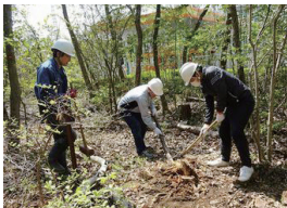
Forest conservation activity in the forest surrounding the plant. (From Dec,2016)