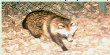
Establishment of an animal pathway

Since 2012, our Nagoya Works has participated in the “Life Sustaining Project” that established an animal pathway at the border with adjacent companies, and hosted corporate greenery visits. The project received the 46th Environment Award (Special Jury Award).