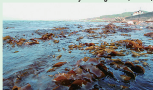
Mashike Town, Hokkaido

We began an experiment to use a by-product (steel slag) in restoration of a kelp seabed in coastal areas in 2004. By 2019 this was implemented in 38 spots in Japan, with a recent additional focus on the effect to “Blue Carbon” (the carbon captured and sequestered by oceans and coastal ecosystems).