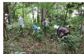
Working in a forest in Fujisawa