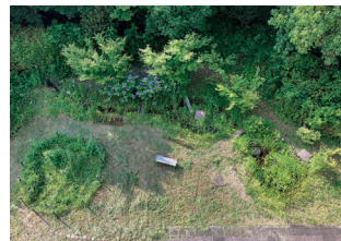
Biotope in the TOPPAN Technical Research Institute, certified by the Ministry of the Environment (September 2023)