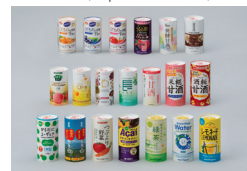
Cartocan (Paper-based beverage container made from thinned wood)