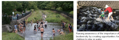
Raising awareness of the importance of biodiversity by creating opportunities for children to play in water